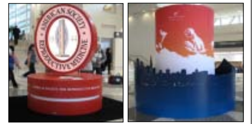
Example of reusable graphics: Undated!

Logos like this rotating sign (left) and the outdoor signage (right) could have been annually reused if the city and year were left off from the text appearing on the graphics.