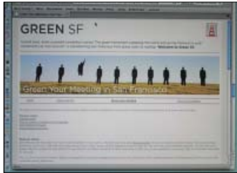
SFCVB's Green Meetings Program highlights services like green transportation. Click here >

The City and County of San Francisco and the Moscone Center are green pioneers both nationally and in the hospitality industry. The U.S. EPA awarded Moscone Center as a sustainable venue in April 2009. Take advantage of our expertise and check out our green meeting tools, from videos on our website to the Exhibitor's Green Guide. If your program is held in Moscone West June-July 2010, ask your Event manager about our 3-