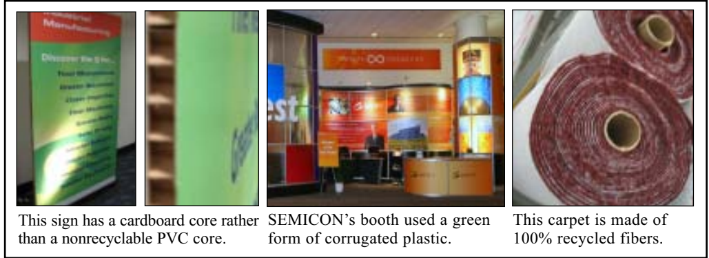
This sign has a cardboard core rather than a nonrecyclable PVC core.

Carpet has always been cleaned and reused. Now it is available with recycled