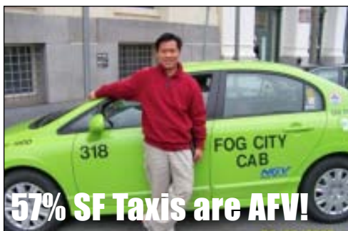
San Francisco's Clean Air Taxi Program Aims to eliminate greenhouse gas emissions (GHG) in taxis by 2020, requiring that by 2011, the city's taxi industry reduce its total greenhouse gas emissions by 50 percent from the current levels and by 20 percent from 1990 levels. More info >

Moscone's Event Manager will be happy to make the arrangements. ▼