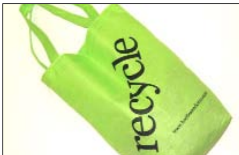
Recycled content saves energy! “Cloth-feel” bags like this are made from recycled PET plastic water bottles or from compostable fibers. See suppliers at left.

GREEN PRODUCTS IN SF: www.sfenvironment.org