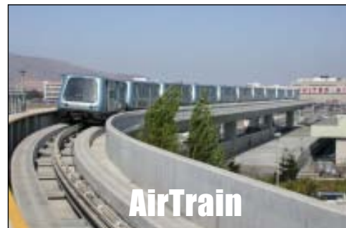
The City has a robust public transit system. AirTrain connects SFO Airport directly to the public transit subway system at Powell and Montgomery street stations, only steps away from the Moscone Center. AirTrain info > SFCVB offers free digital maps of SF >