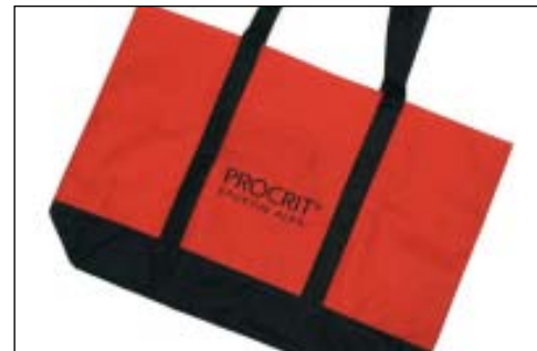
Durable cloth bags or backpacks last longest Durable cloth is the next best green option. These have a longer life, will be reusable or can be given away to nonprofits to reuse.