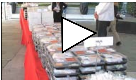
Compostable serveware used since 2007 SAVOR...San Francisco concessions have served delicious fresh salads in corn-resin compostable serveware. Watch the video! >

All large seated catered functions can be packaged a variety of ways. To green these large events, convey in advance your green goals.