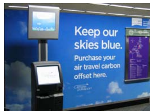
Climate Offset Kiosk in SFO's Terminal 3 For every ton of offsets that you purchase, an equivalent amount of greenhouse gases will be reduced. Climate Passport also allocates $1.50 per ton to the SFCarbon Fund, which invests in greenhouse gas reduction projects within San Francisco.