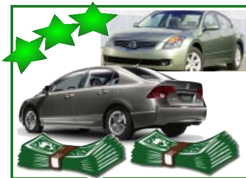
Green rental car program at SFO's SFO now offers the nation's first Green Rental Car program that rewards customers for renting “green” alternative-fueled vehicles such as the Honda Civic Hybrid (left) or Nissan Altima Hybrid (right). Check site for participating rental firms. >